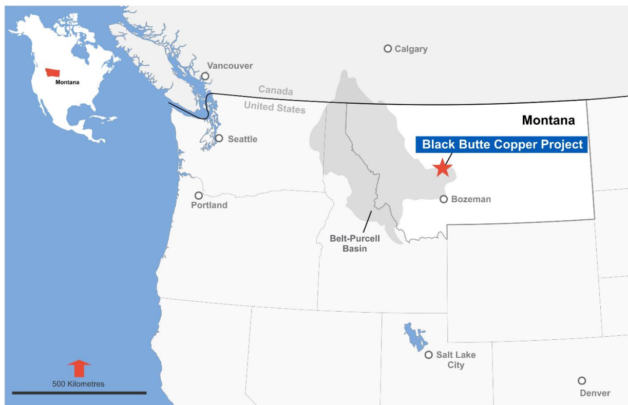
Figure 1: Black Butte Project Location

Situated on private ranch land in Meagher County, the project is near road, power, and rail infrastructure. It promises job creation and economic benefits for the local community while protecting the watershed.