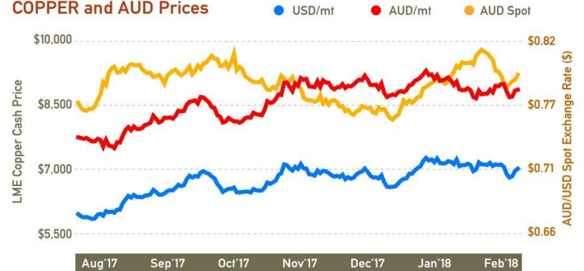
COPPER and AUD Prices