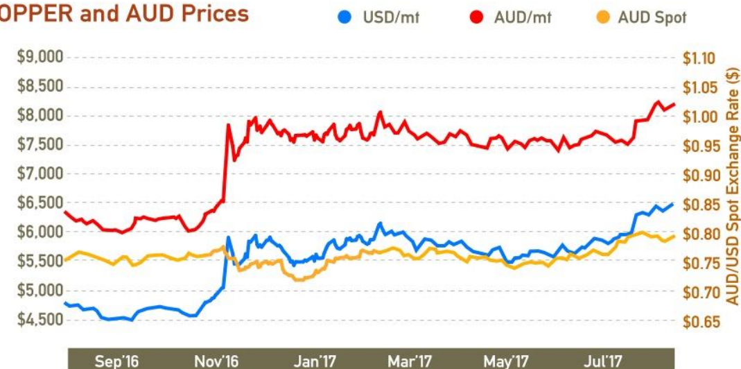
COPPER and AUD Prices