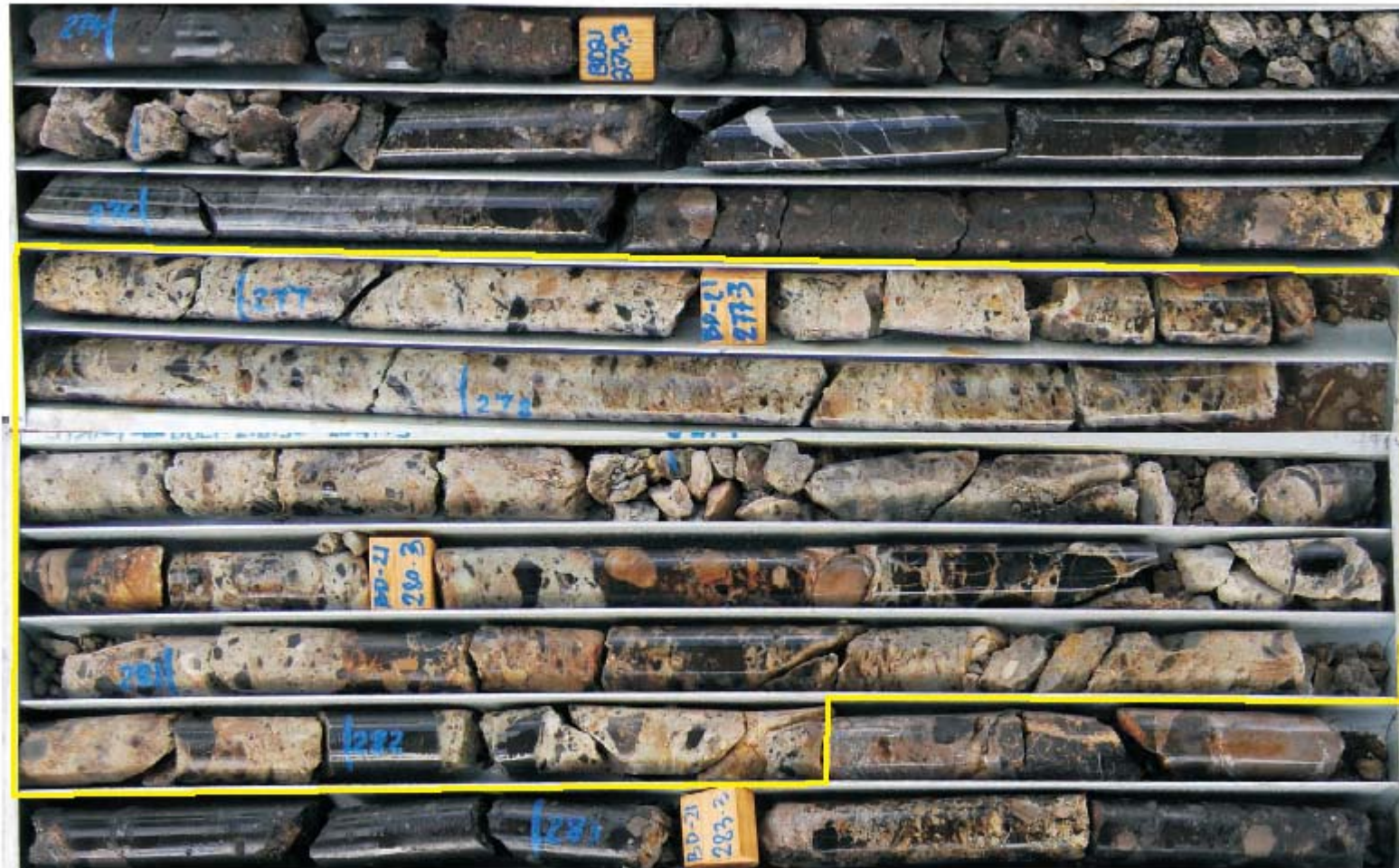
YALCO - TALUS BRECCIA LOCATED IN BD21